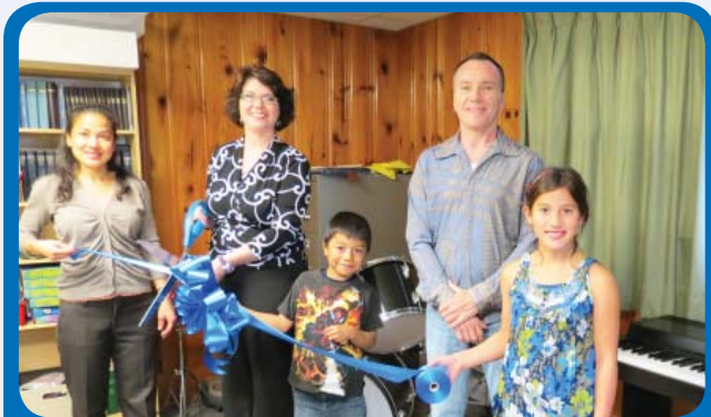
Music School of Delaware