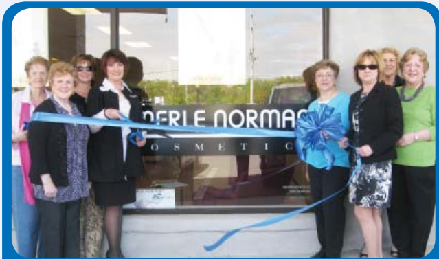
Merle Norman Cosmetics

to our Members Celebrating with a Ribbon Cutting!