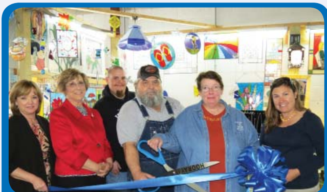
Back Bay Art Glass

SMILEY is looking for a few good men... and women!