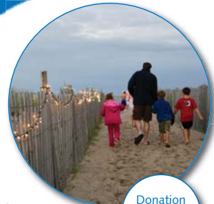
Donation Based Activities!