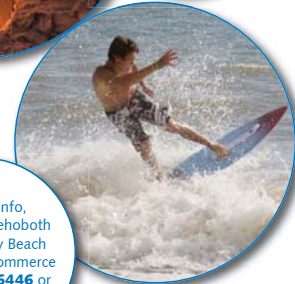
For more info, contact the Rehoboth Beach-Dewey Beach Chamber of Commerce at 302-227-6446 or Beach-Fun.com