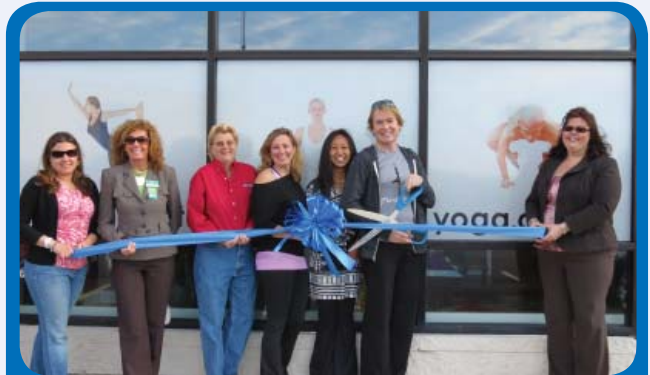
Rehoboth Beach Power Yoga