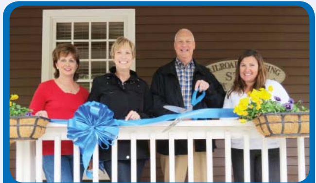
Point of Sale Solutions