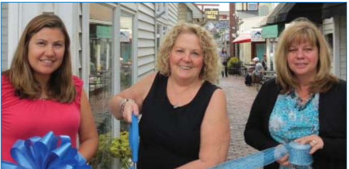
Little Egg Harbor Soap