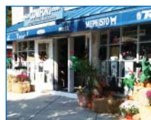
just COMFORT shoes

Special thanks to the businesses who decorated for the Sea Witch Festival. Top Three are Brighton "Frighton" Suites, Avenue Apothecary & Spa, and just COMFORT shoes. Best in Show includes: Salon LaRoc, Avenue Inn, Something Comfortable, Bella Mia, and Atlantic View.