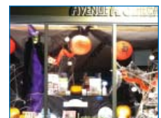
Avenue Apothecary & Spa