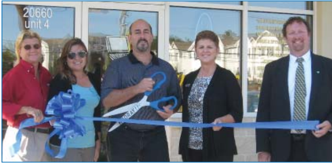
Delaware PC Services