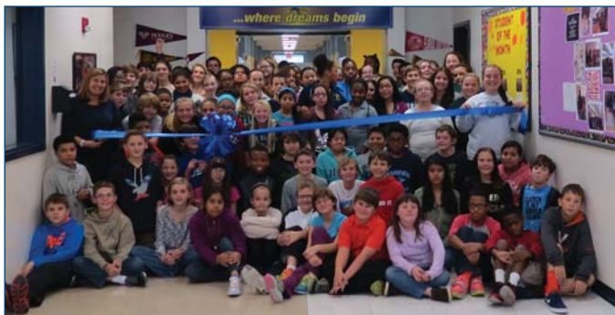
Mariner Middle School