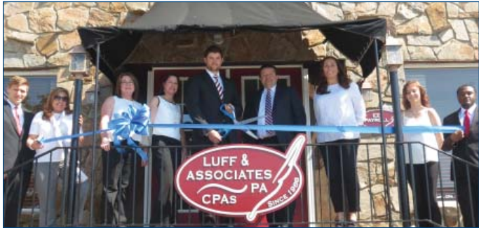
Luff & Associates, CPA