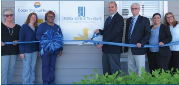
Urology Associates of Dover