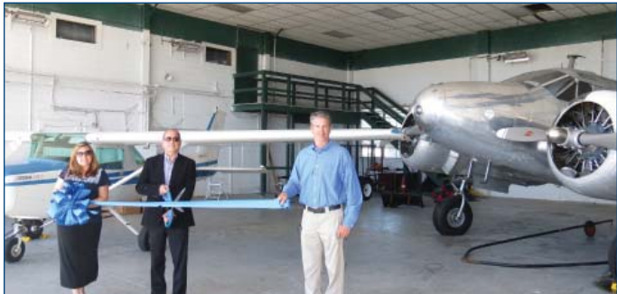
Norads Aerial Services