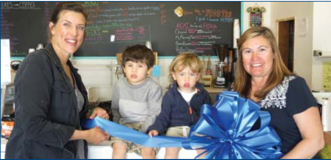
The Juice Box