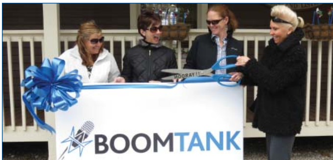
Boomtank.com Boomtank Media, LLC