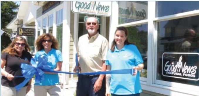
Good News Natural Foods