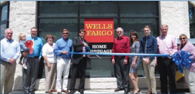
Wells Fargo Home Mortgage