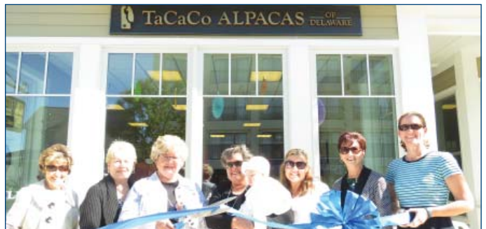
TaCaCo Alpacas of Delaware