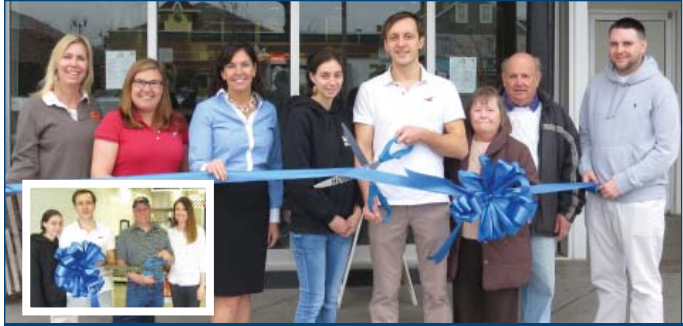
Mason's Famous Lobster Rolls