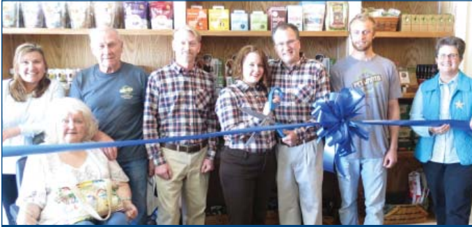
Pet Wants Rehoboth Beach