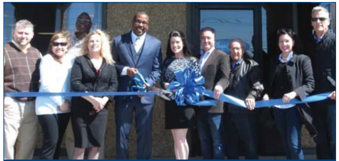
The Sleep Emporium