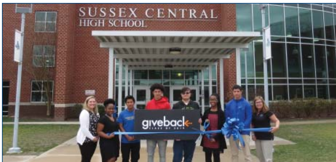
Give Something Back Foundation