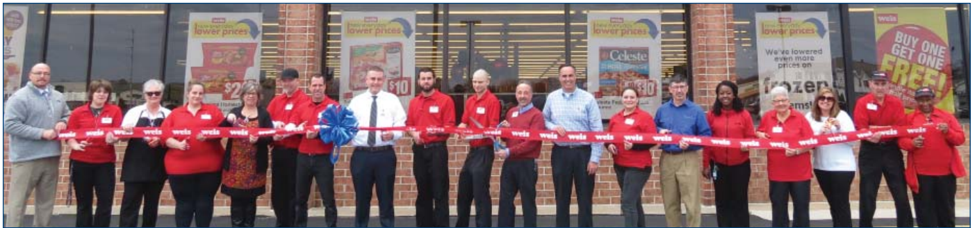
Weis Markets · Mega Sponsor of the Dewey Beach Movies & Bonfires