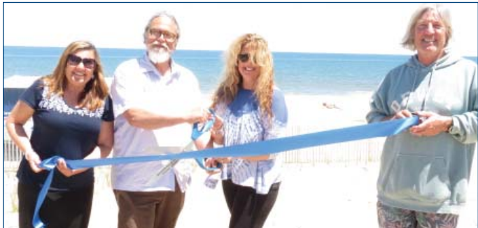
Dewey Beach Yoga