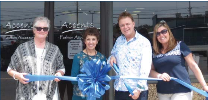
Accents Fashion Jewelry Outlet