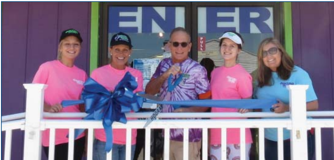
The Fractured Prune - 10 Years