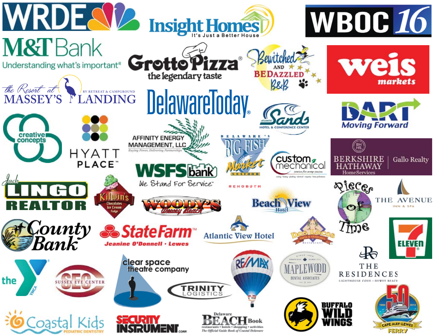
Thanks to Sponsor DART First State Transit! (more photos to come)

The Chamber of Commerce is proud to have our Members as sponsors! We greatly appreciate your support of the Sea Witch® Festival, Beach Goes Blue...Red & White, Tool, Spring & Fall Sidewalk Sales and the Sandcastle Contest.