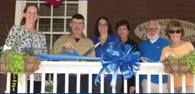
Farr Engineering-Free Properties