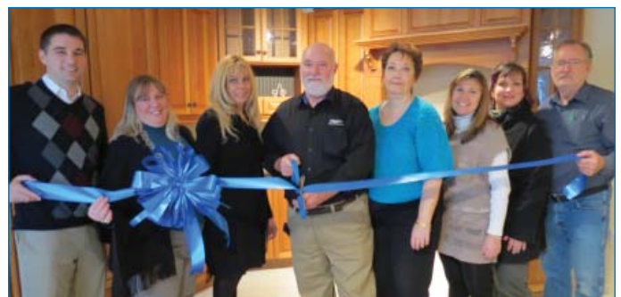
Phippin's Cabinetry & Renovations