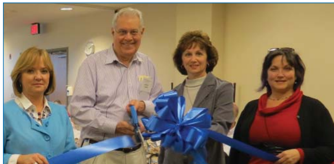
Sussex County Parkinson Education & Support Group