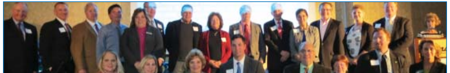
Top Sponsorship Recognition