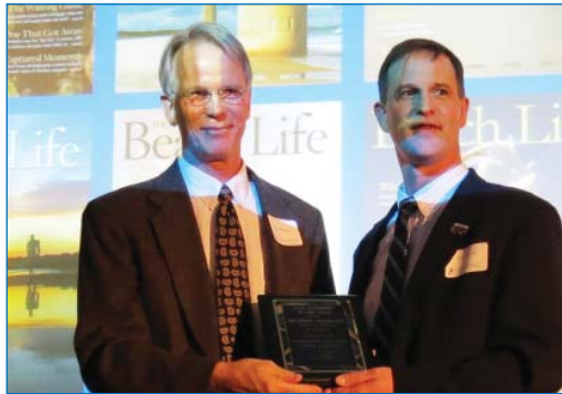
Delaware Beach Life