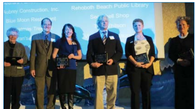
20 Years or More Chamber Membership