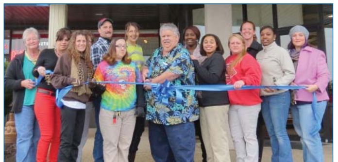
Peppers - New Location!