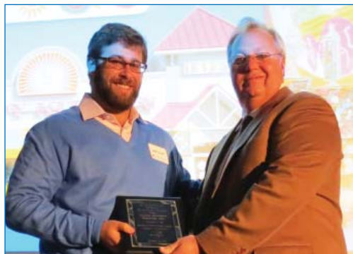
Candy Kitchen Shoppes