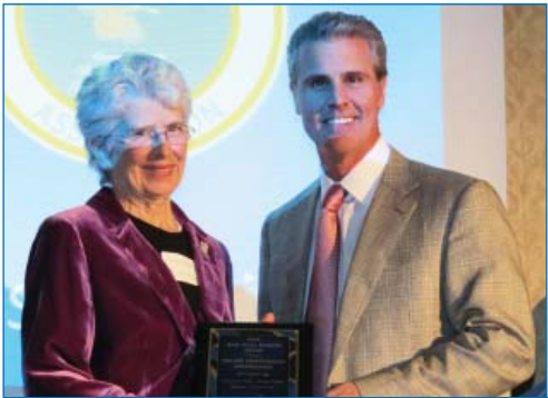
Village Improvement Assoc.