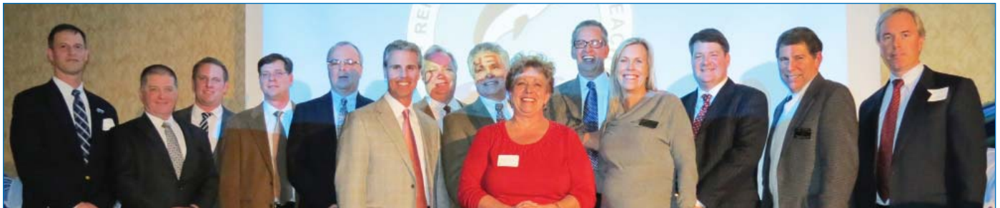
2013 Chamber of Commerce Board of Directors

Board of Directors, Special Award Winners, Sponsors and Volunteers were recognized before a sell out crowd at the 2013 Installation Dinner held at the Atlantic Sands Hotel!