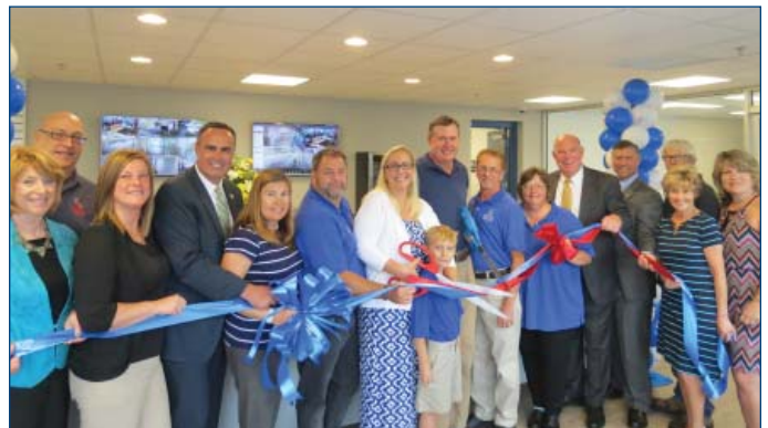
Delaware Beach Storage Center