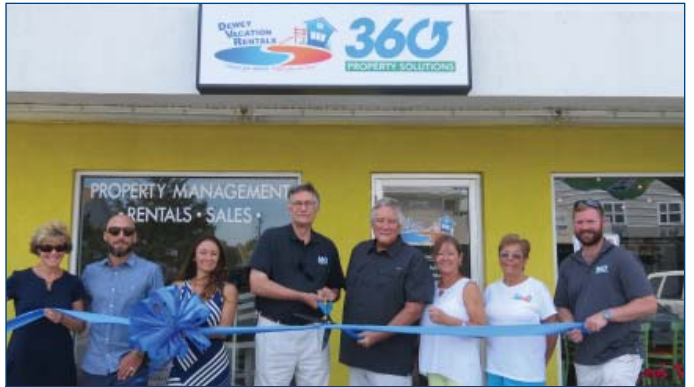
Dewey Vacation Rentals