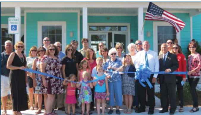
The Resort at Massey's Landing