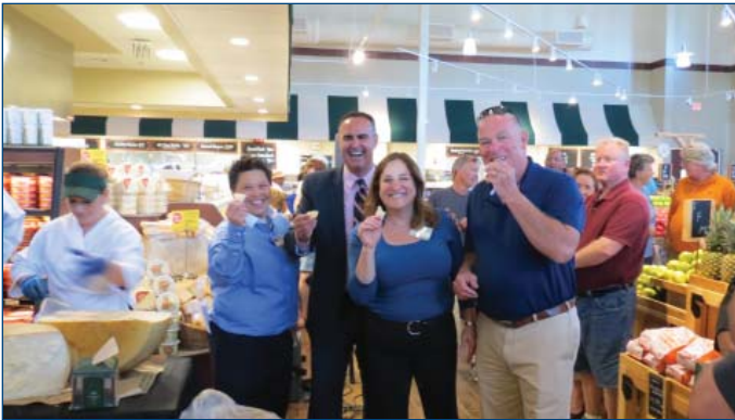
The Fresh Market