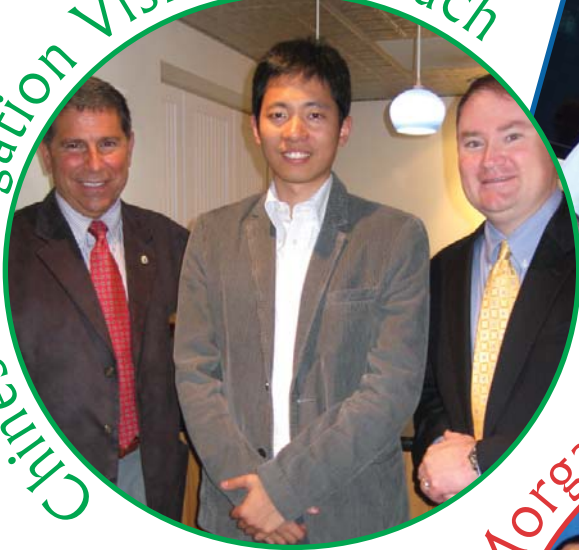
Chinese Delegation Visits The Beach