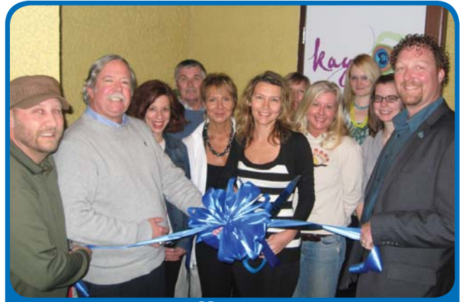
Kaya Wellness & Yoga