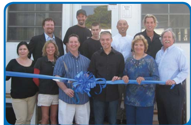
Port - Dewey Beach