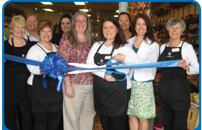
Harry & David