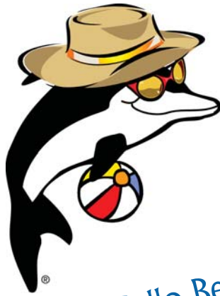
Prudential Gallo Beach Clean-Up