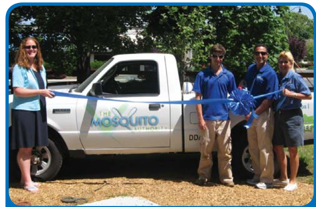
The Mosquito Authority