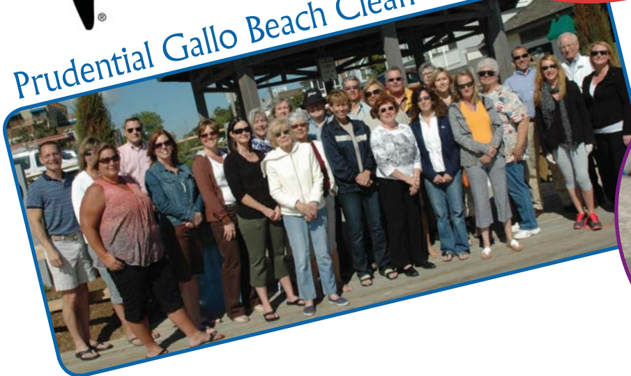
Prudential Gallo Beach Clean-Up