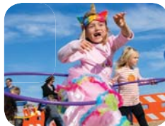
Kid's Beach Games