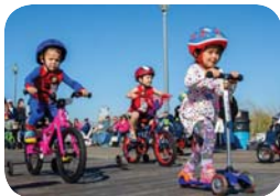
Tyke Bike on the Boards