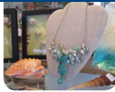
Spring & Fall Sidewalk Sales May 17-19 · Oct. 4-6