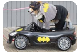
Costumed Dog Parade