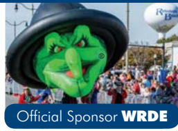
Sea Witch Festival® October 25-27