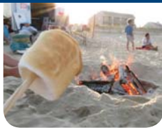
Dewey Beach Movies & Bonfires Summer 2019