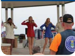
Beach Goes Red, White & Blue! June 8

Your business can be a part of all the Rehoboth Beach - Dewey Beach Chamber of Commerce & Visitors Center events. Pick your sponsorship below!