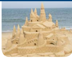
Sandcastle & Sculpture Contest September 7